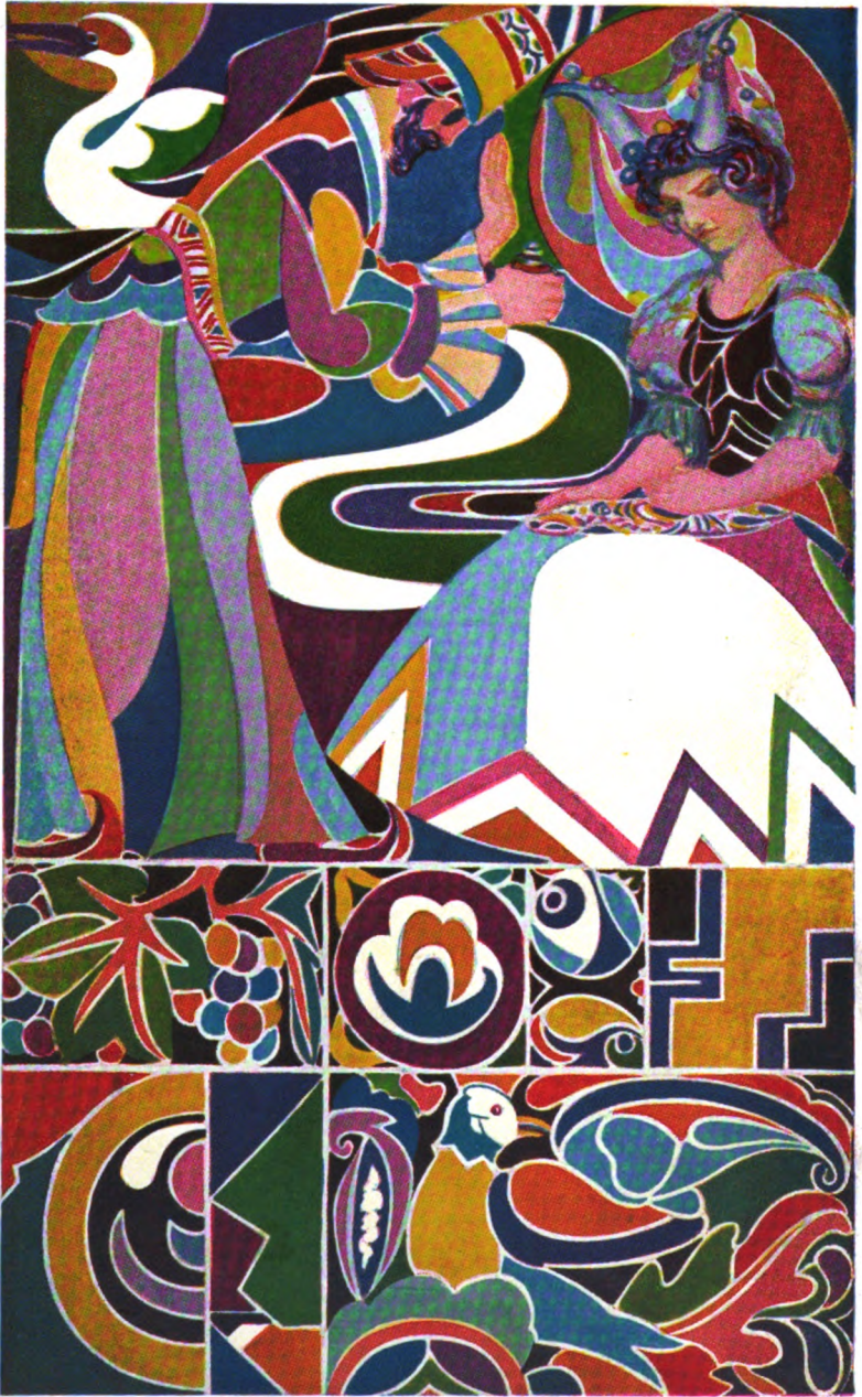
Peerless Beauty, her horns swathed in silk and gleaming with jewels, received him coldly Page 43